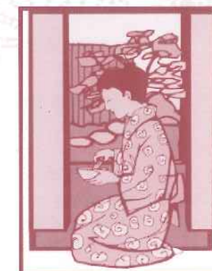
Japanese Tea Ceremony