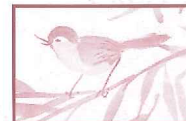
Brush Painting - Amy Wada