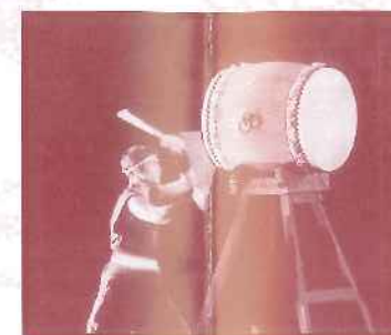
O Nami Taiko